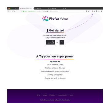
Figure 3: The Firefox Voice extension installation webpage.